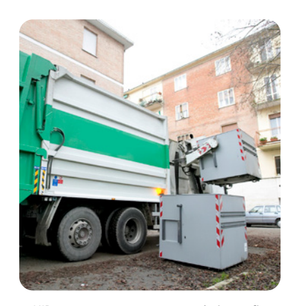
HID can create a custom tag solution to fit your application requirements for chip type, dimensions, programming and materials.